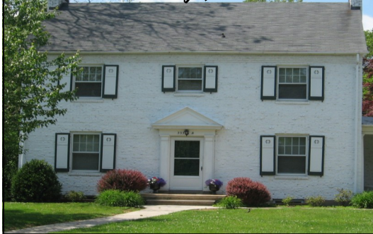
The Parsonage— a ministry of Love INC